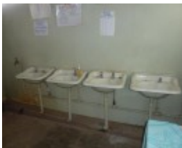
196487 f RAAF Base & Migrant Centre Benalla May 2015.JPG